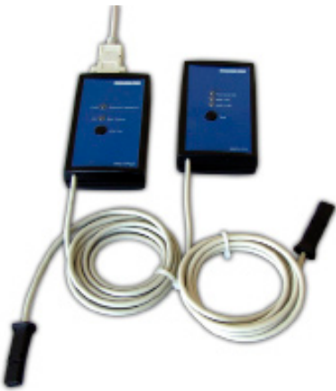
Accessory: On-site diagnostic with WIC1-TU PC communication with WIC1-PC2

International: Woodward PO Box 1519 Fort Collins CO, USA 80522-1519 1000 East Drake Road Fort Collins CO 80525 Ph: +1 (970) 498-3838 Fax: +1 (970) 498-3058 Europe Woodward SEG GmbH & Co. KG Krefelder Weg 47 47906 Kempen, Germany Ph: +49 (0) 2152 145-319 or -636 Fax: +49 (0) 2152 145-354 email: SalesEMEA_PGD@woodward.com